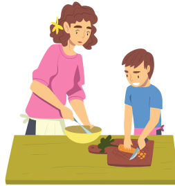
Make & pack lunch